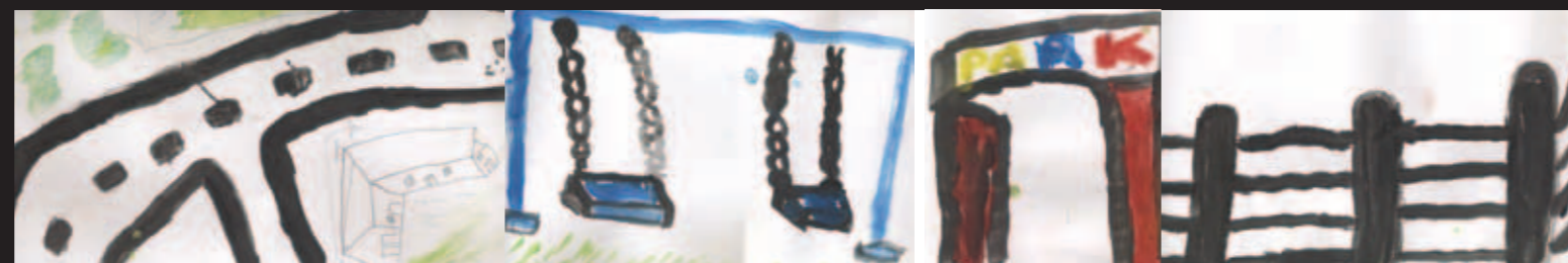
PHOTO CREDITS Above drawings by the Nompumelelo community | Top right and bottom © Bazil Raubach