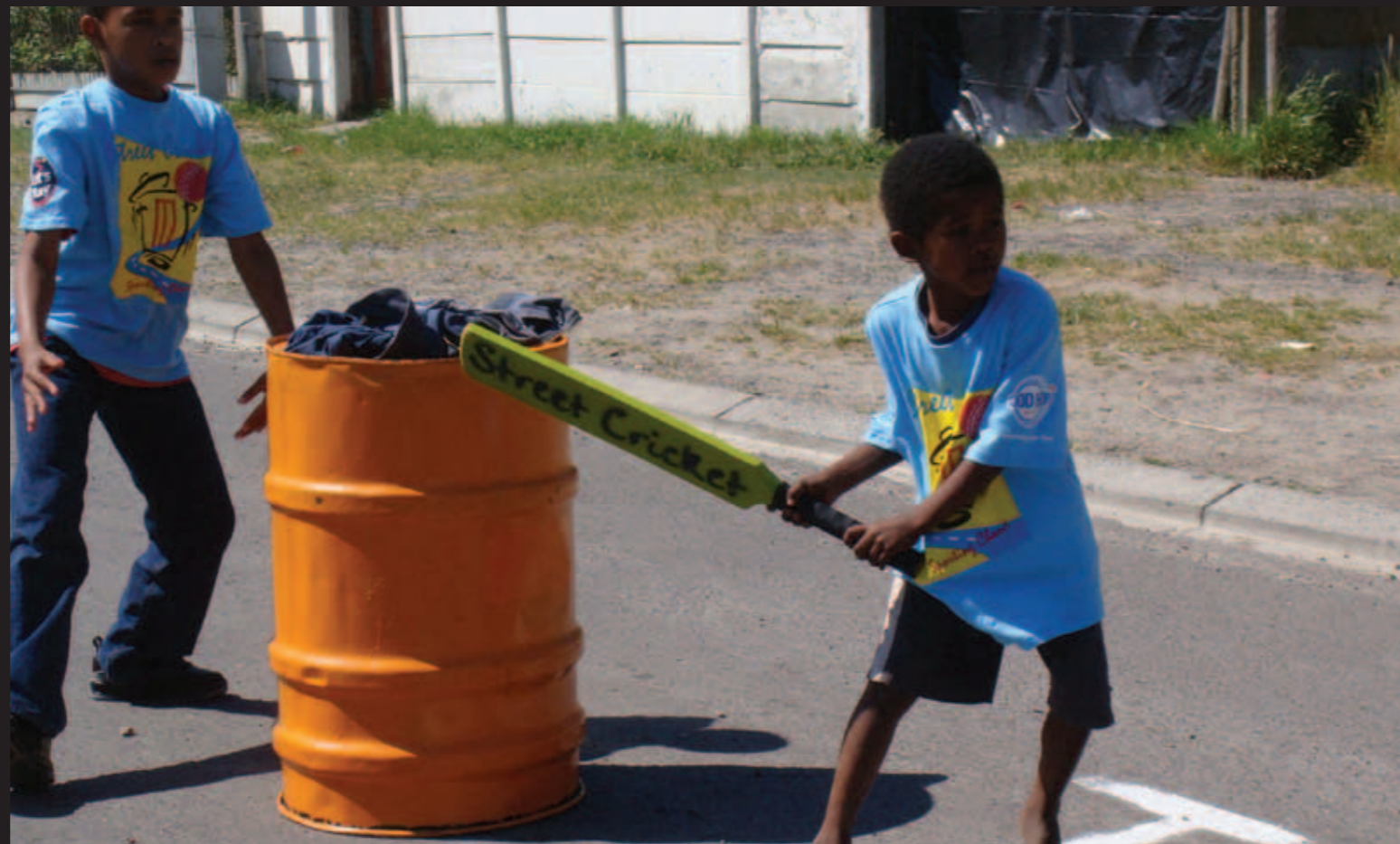
PHOTO CREDITS Two photos top left © Elena Ghanotakis | Top right © Elena Ghanotakis | Bottom © Sporting Chance / www.sportingchance.co.za